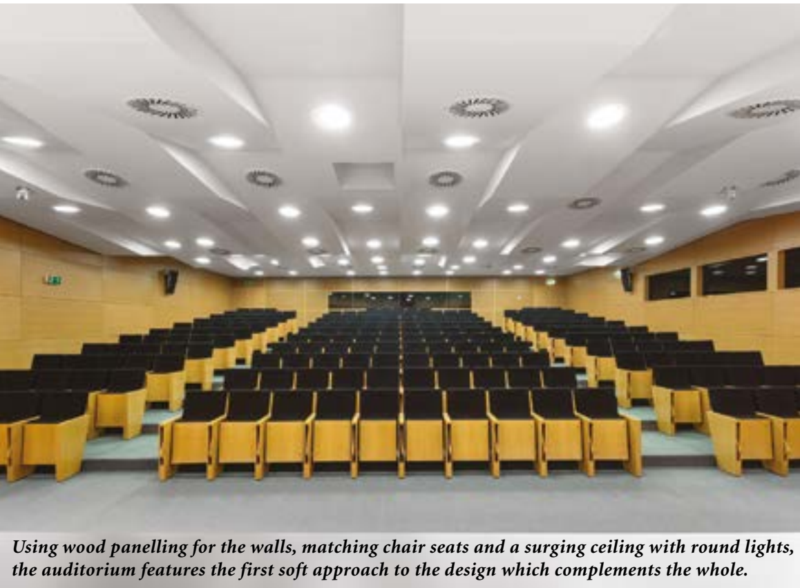
Using wood panelling for the walls, matching chair seats and a surging ceiling with round lights, the auditorium features the first soft approach to the design which complements the whole.

The building is equipped with high technology and safety features that make it one of the most advanced institutional buildings in Portugal.