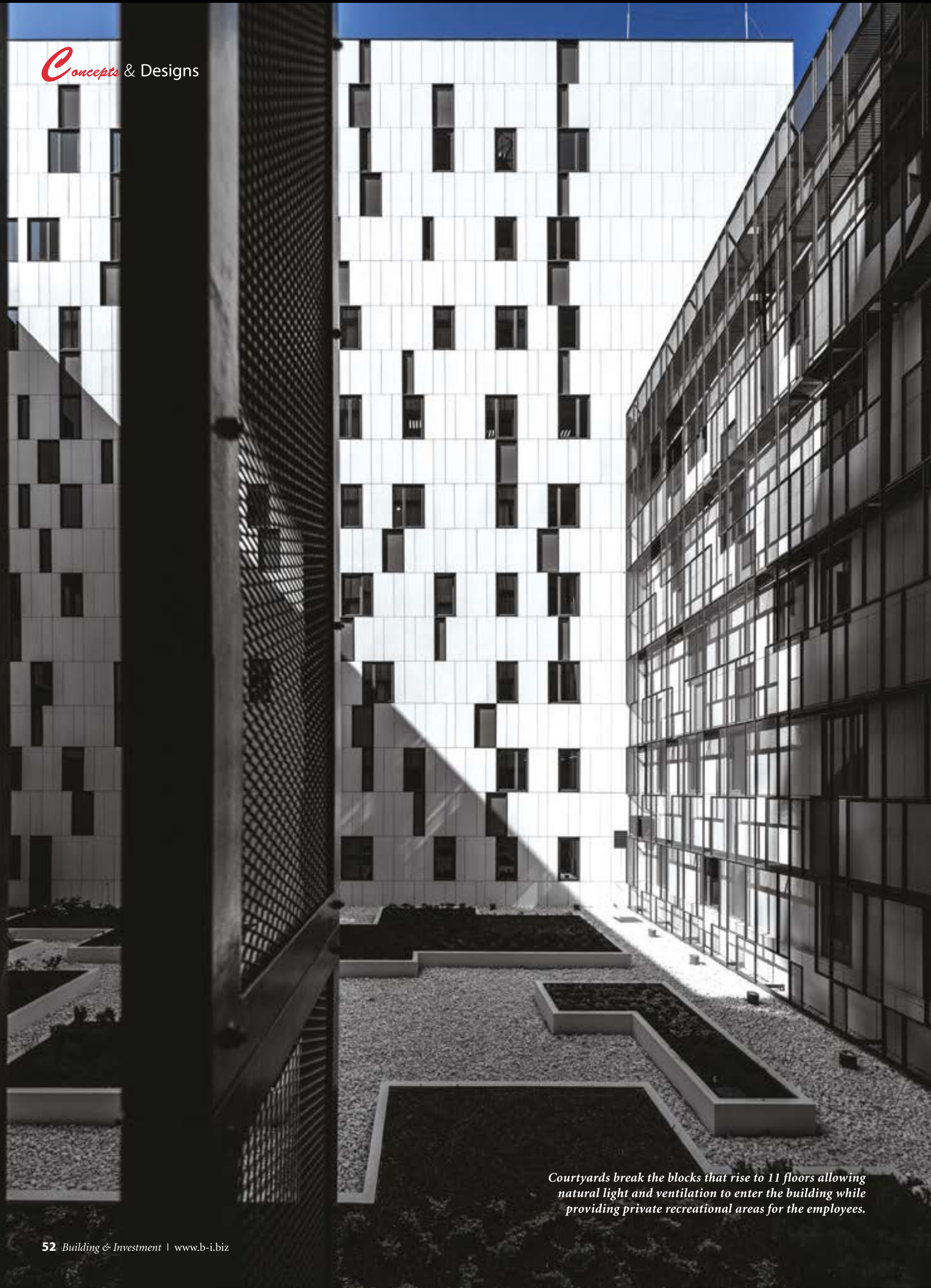
Courtyards break the blocks that rise to 11 floors allowing natural light and ventilation to enter the building while providing private recreational areas for the employees.