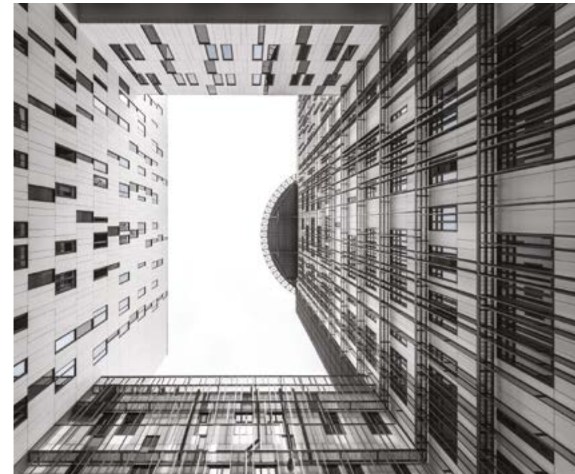
A monochromatic façade delineated by clean geometric and regular spacing of rectangular windows on walls are the elements that combine the separate volumes of the building into a consistent whole.

The project concept evoked greater proximity between the traditional logic of public building of this type, making the whole complex on a humanized scale, rigorous but not austere, dominant but not dominating. We wanted to show its character as an institution without having to boast an oppressive scale.” Miguel Saraiva