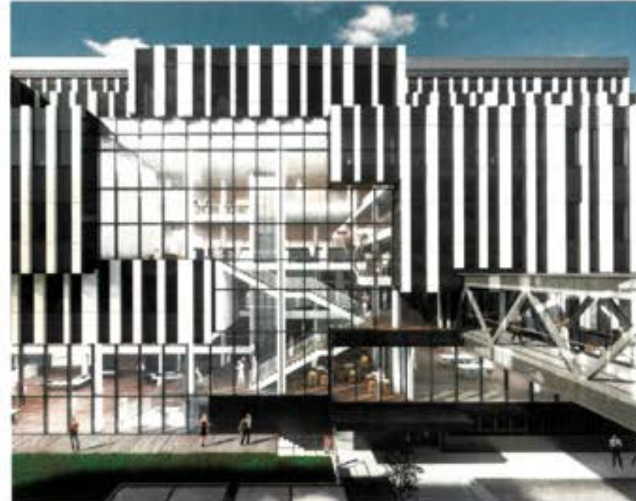
Central Europe: Boehringer Ingelheim research institute for molecular pathology in Vienna