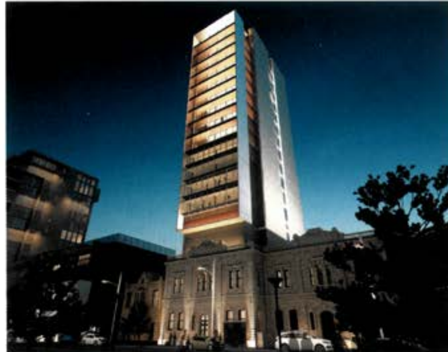
Australasia: 203 North Terrace in Adelaide by GHD Woodhead is a 23-storey residential tower and adapted listed building.

Where in the world? The top architectural firms in each global region ranked by fee income