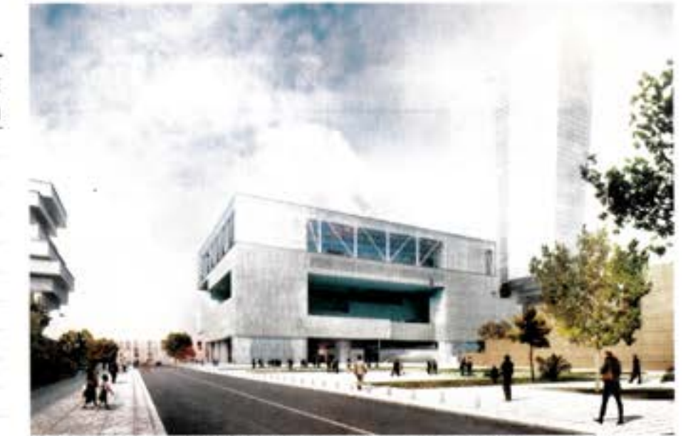
South America: ACXT-IDOM's Lima Convention Center was completed in 2015.