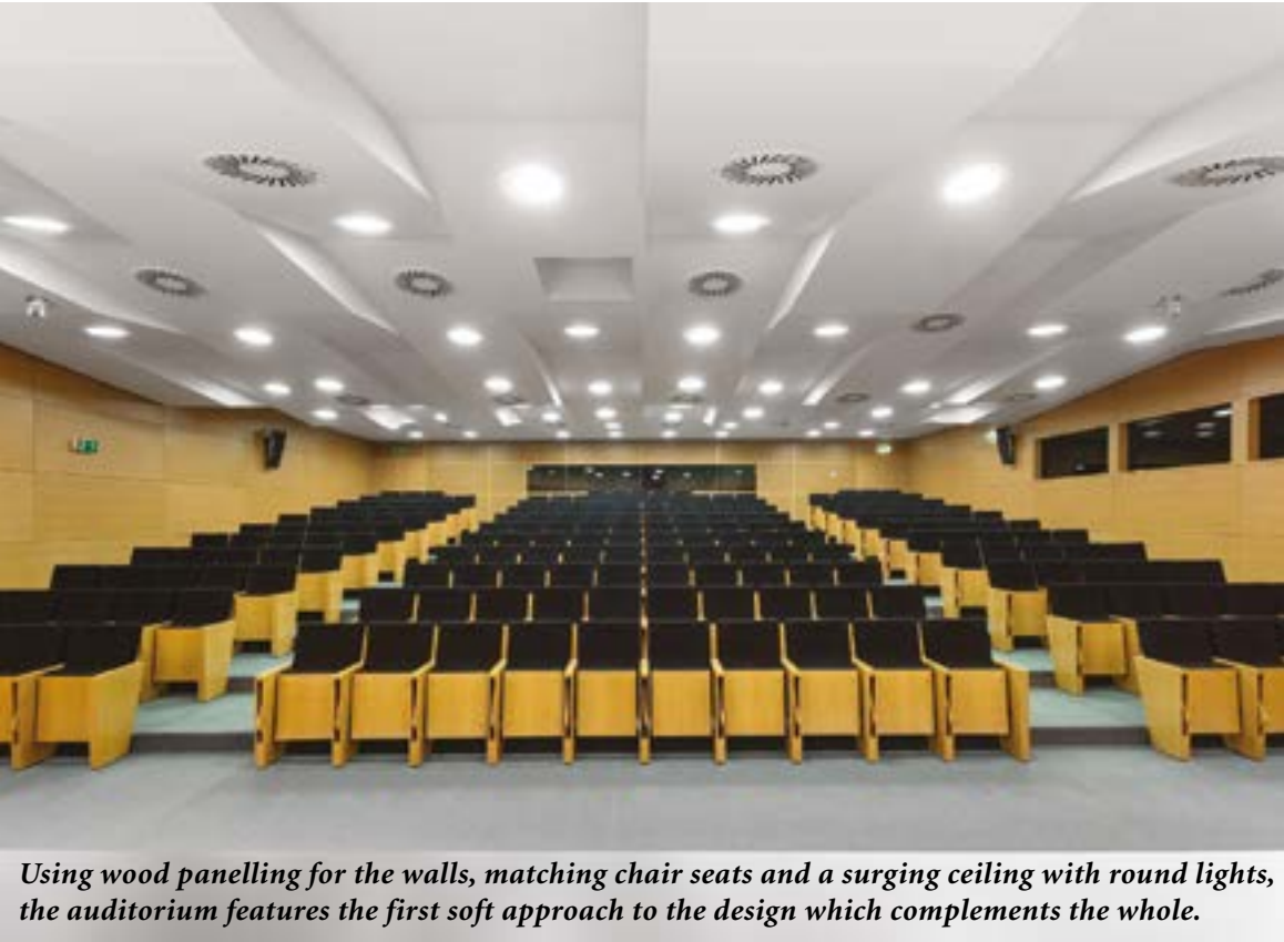
Using wood panelling for the walls, matching chair seats and a surging ceiling with round lights, the auditorium features the first soft approach to the design which complements the whole.

The building is equipped with high technology and safety features that make it one of the most advanced institutional buildings in Portugal.