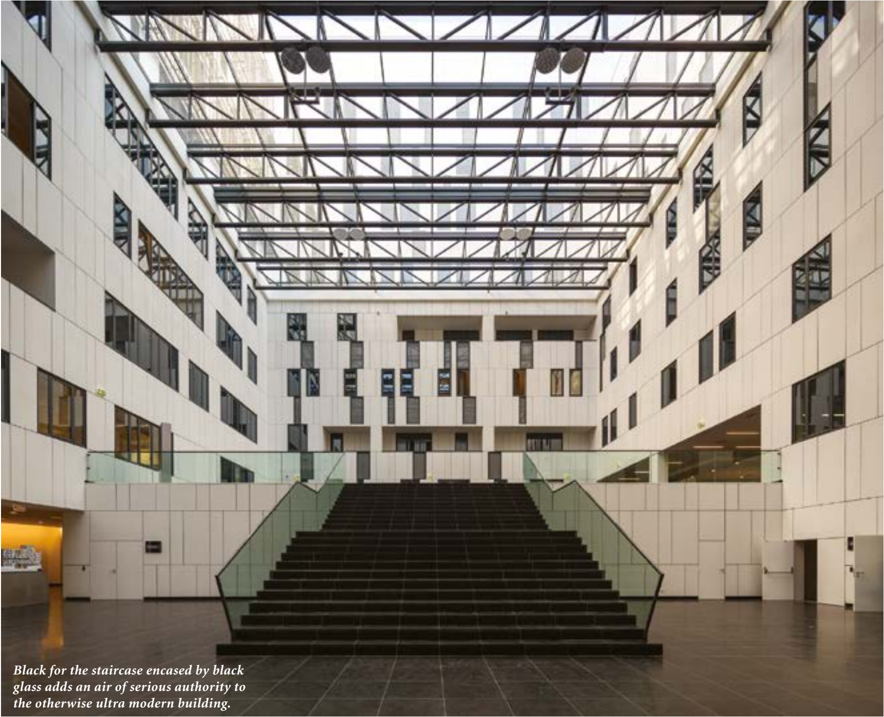
Black for the staircase encased by black glass adds an air of serious authority to the otherwise ultra modern building.